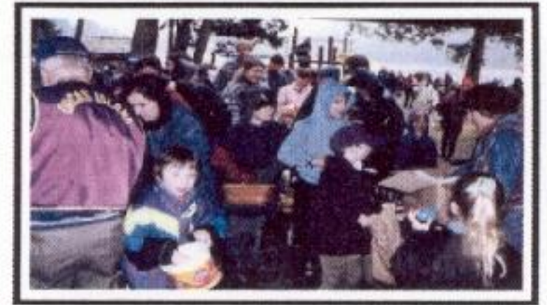
Easter Egg Hunt in Moran State Park as youngsters share in Lions activities